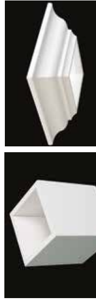
OUTER WRAP Available in 5", 7" and 12" lengths for 4", 6", 8" and 10" post wraps; 1/2" thick 3-5/8" CROWN MOULDING SET Available for 4", 6", 8" and 10" post wraps

KLEERWrap accessories are available for all post wrap sizes.