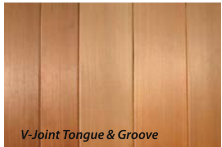
V-Joint Tongue & Groove

Bevel Siding Coverages ( lin. ft. needed ) 6" - sq. ft. to cover x 2.8 8" - sq. ft. to cover x 1.9